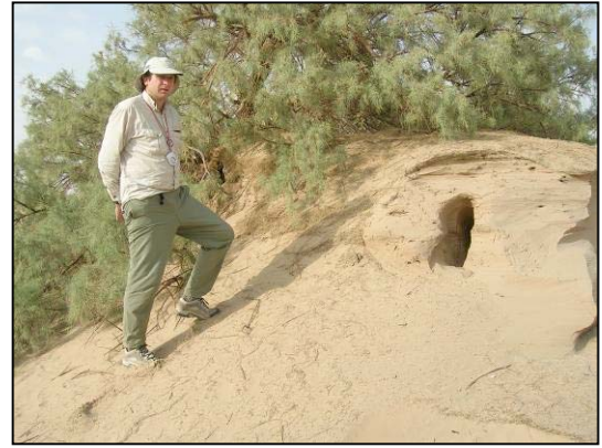
Figure 3. Fox den dug into the root ball of a Tamarix shrub in a wadi