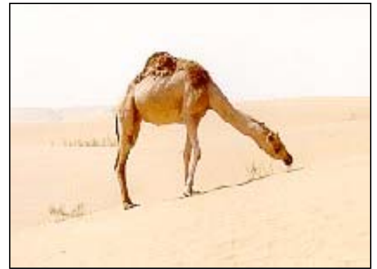
Figure 4. Camel grazing on the sparsely vegetated dunes of Block S-1.

Production flaring historically has been conducted in open-desert environment without security fencing or protection of soil or groundwater resources. In addition, oils and other chemicals that have been spilled or otherwise released in the sand seas have been left in place.