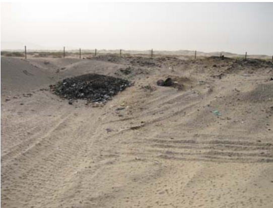
Figure 5. Ad hoc disposal of solid waste in an open, unlined pit at a drilling site.

Because of the difficulty in transporting materials in the sand sea environment, previous operators often used open unlined pits near drilling sites and production facilities to collect and store wastes (Figure 5). This has led to impacts to the sandy environment. Food wastes disposed of in this manner attract mammals and birds. Oily waste liquids have been intentionally or accidentally discharged in these pits, in unlined evaporation pits, and in the open dune environments.